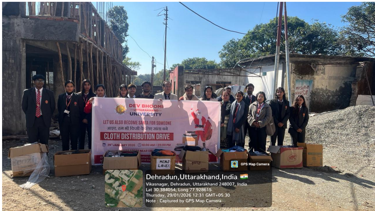
Honorable VC, faculties and students involved with the banner of cloth donation drive